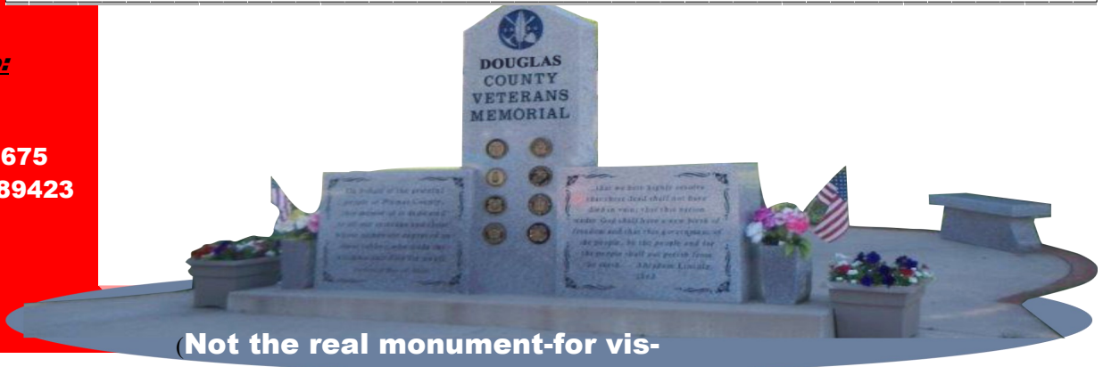
(Not the real monument-for vis-